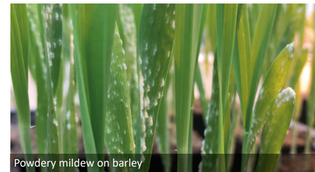
Powdery mildew on barley