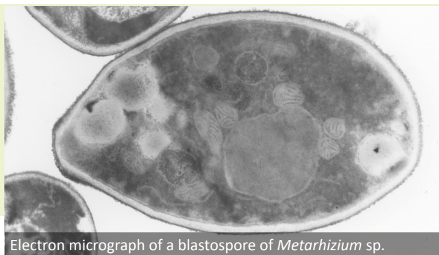
Electron micrograph of a blastospore of Metarhizium sp.