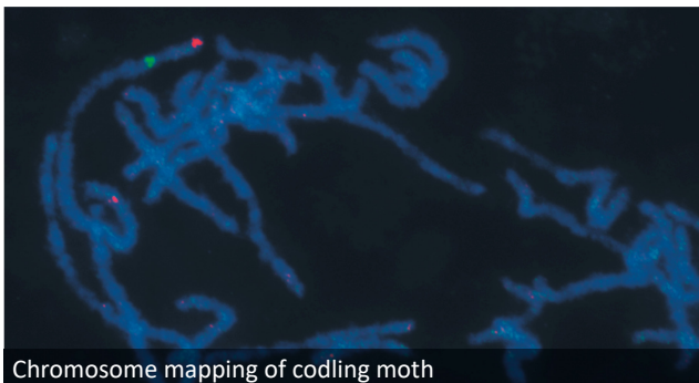
Chromosome mapping of codling moth

Also in developing countries, there is an increasing demand for non-chemical crop protection and biological control. To provide transfer of our knowledge and know-how, we participate in international, co-operative projects worldwide.