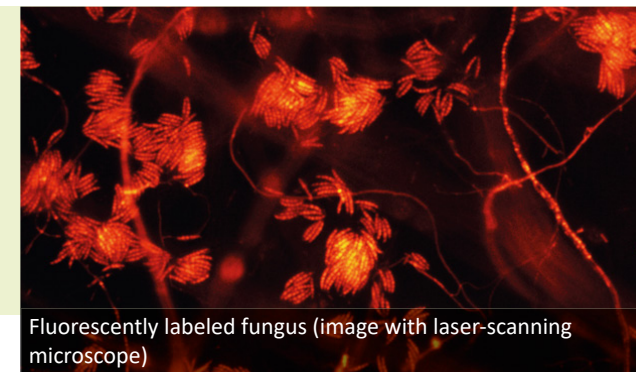
Fluorescently labeled fungus (image with laser-scanning microscope)