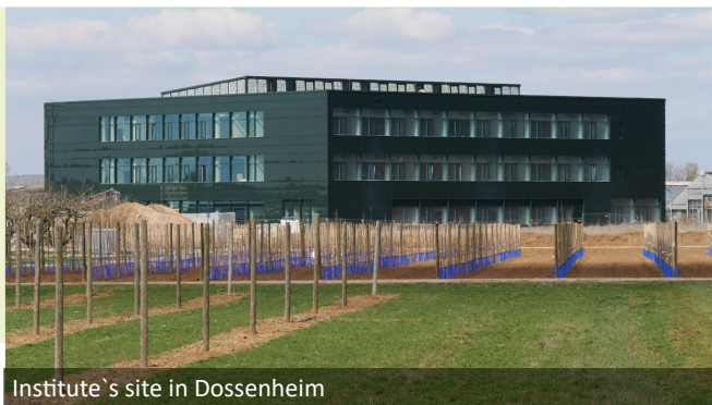
Institute's site in Dossenheim